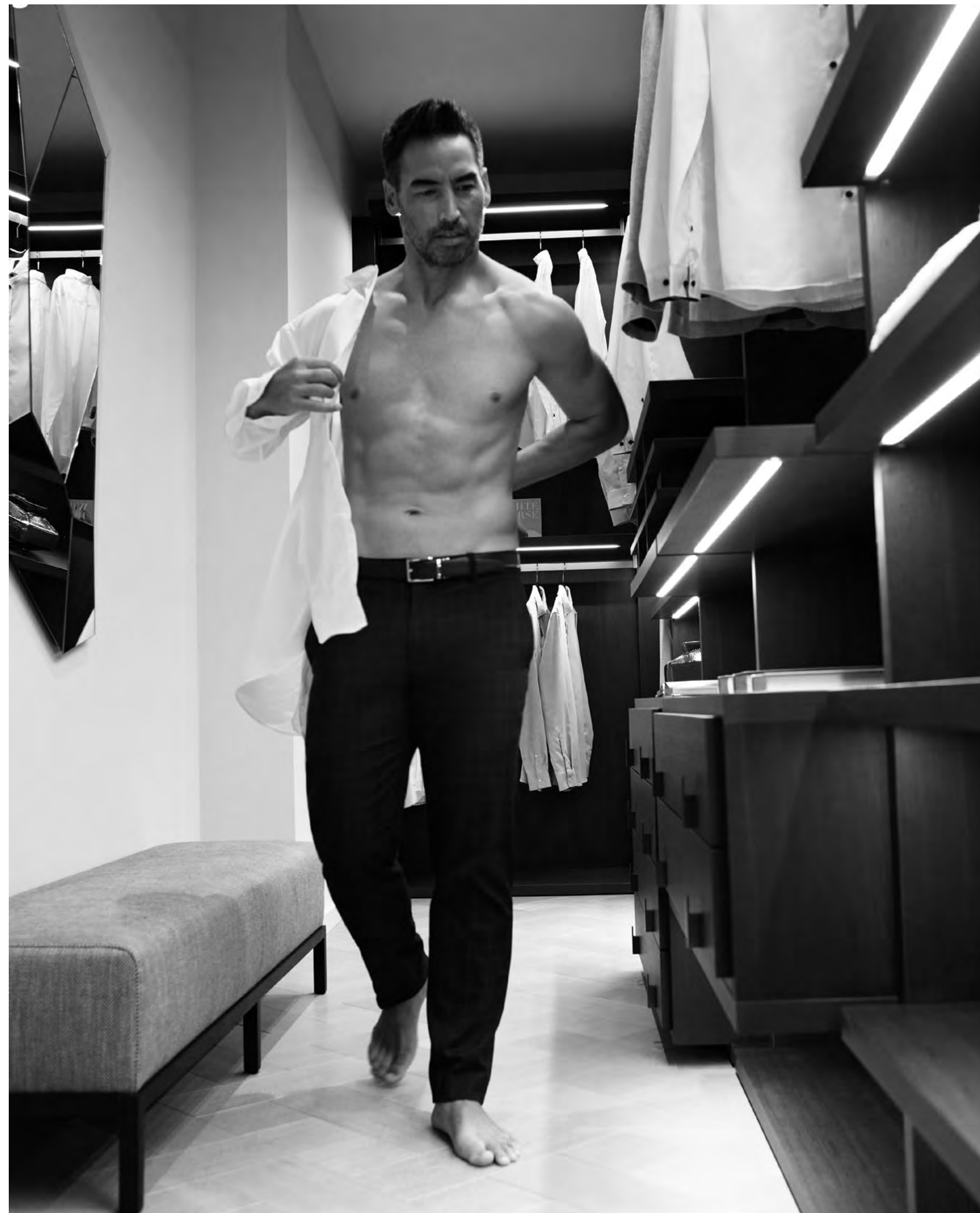
Dual Primary Walk-In Closets