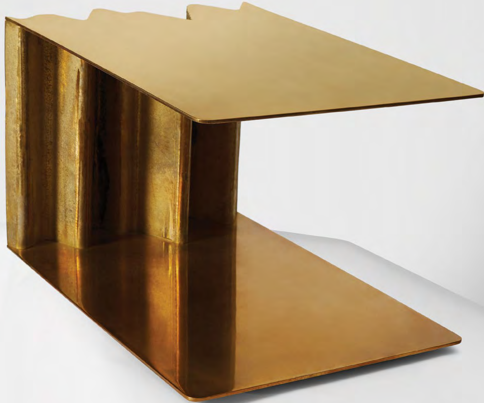
Be Mine Table Designed by Massimo Castagna for Henge, this artisanal, handcrafted low table features a sand-casted brass mullion contrasted with a high-shine brass top and base.