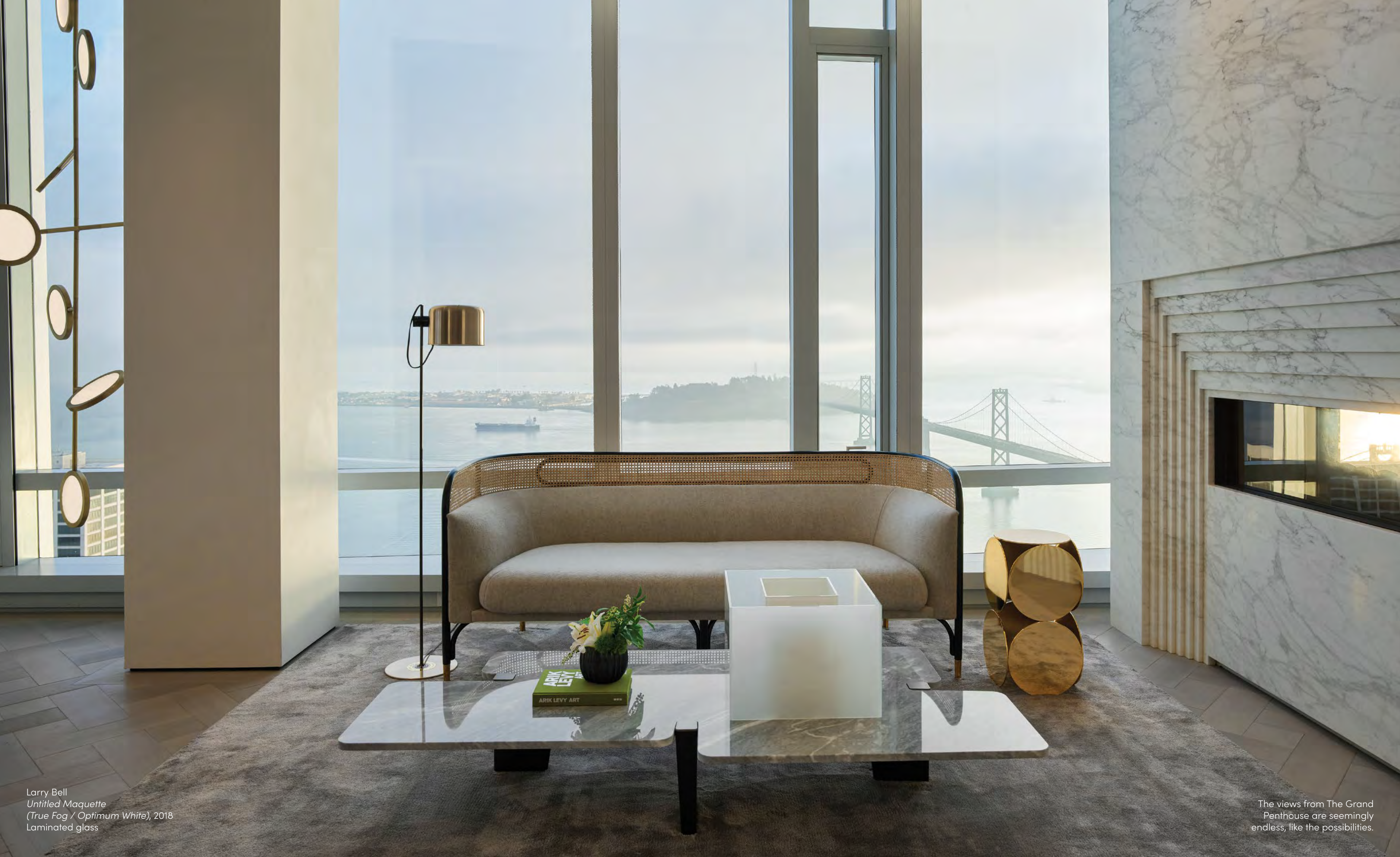
Larry Bell Untitled Maquette ( True Fog / Optimum White ), 2018 Laminated glass

The views from The Grand Penthouse are seemingly endless, like the possibilities.