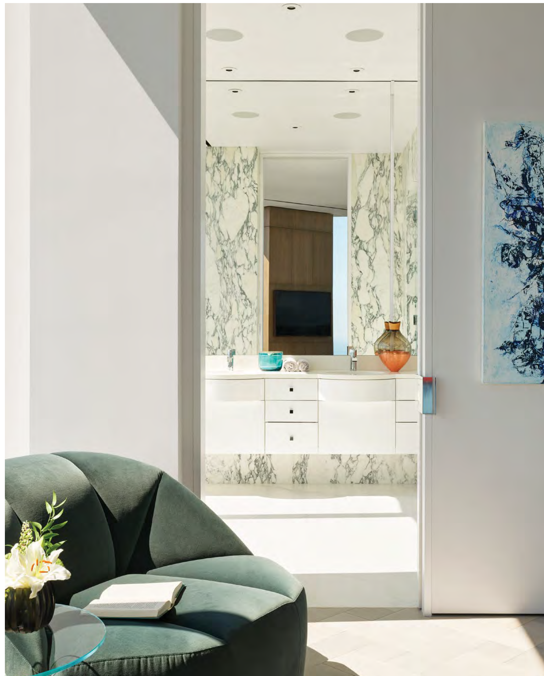
Jim Hodges Arena I (white/ white) , 2006 Mixed media