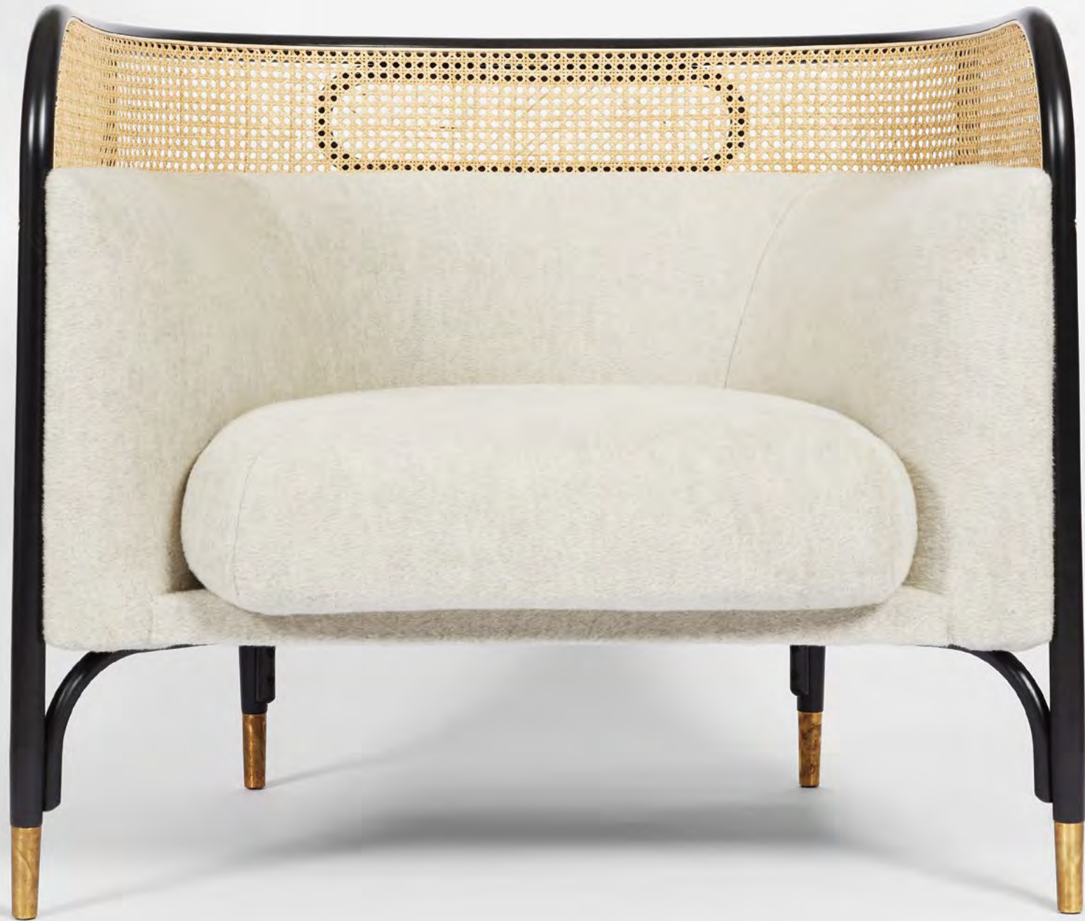
Thonet Targa Lounge Armchair Custom mohair fabric reinterprets the traditional form and injects softness to the city-facing vignette.