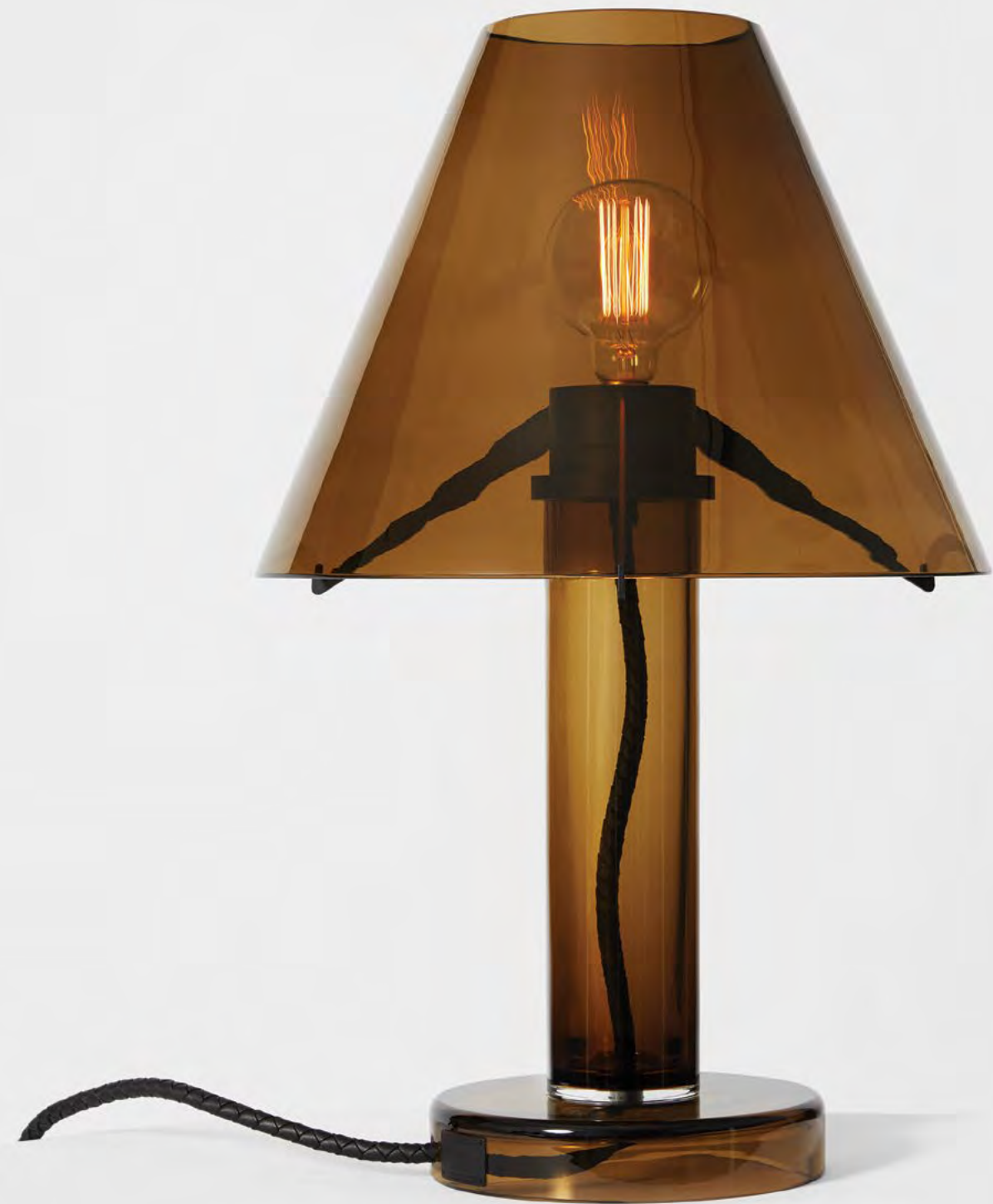
Bottega Veneta Murano Table Lamp Crafted from cigar-colored Murano glass that diffuses the light subtly against the sky at night. Minimally designed but intricate in its handblown process; a coaxial leather-covered electrical cord punctuates this iconic piece.