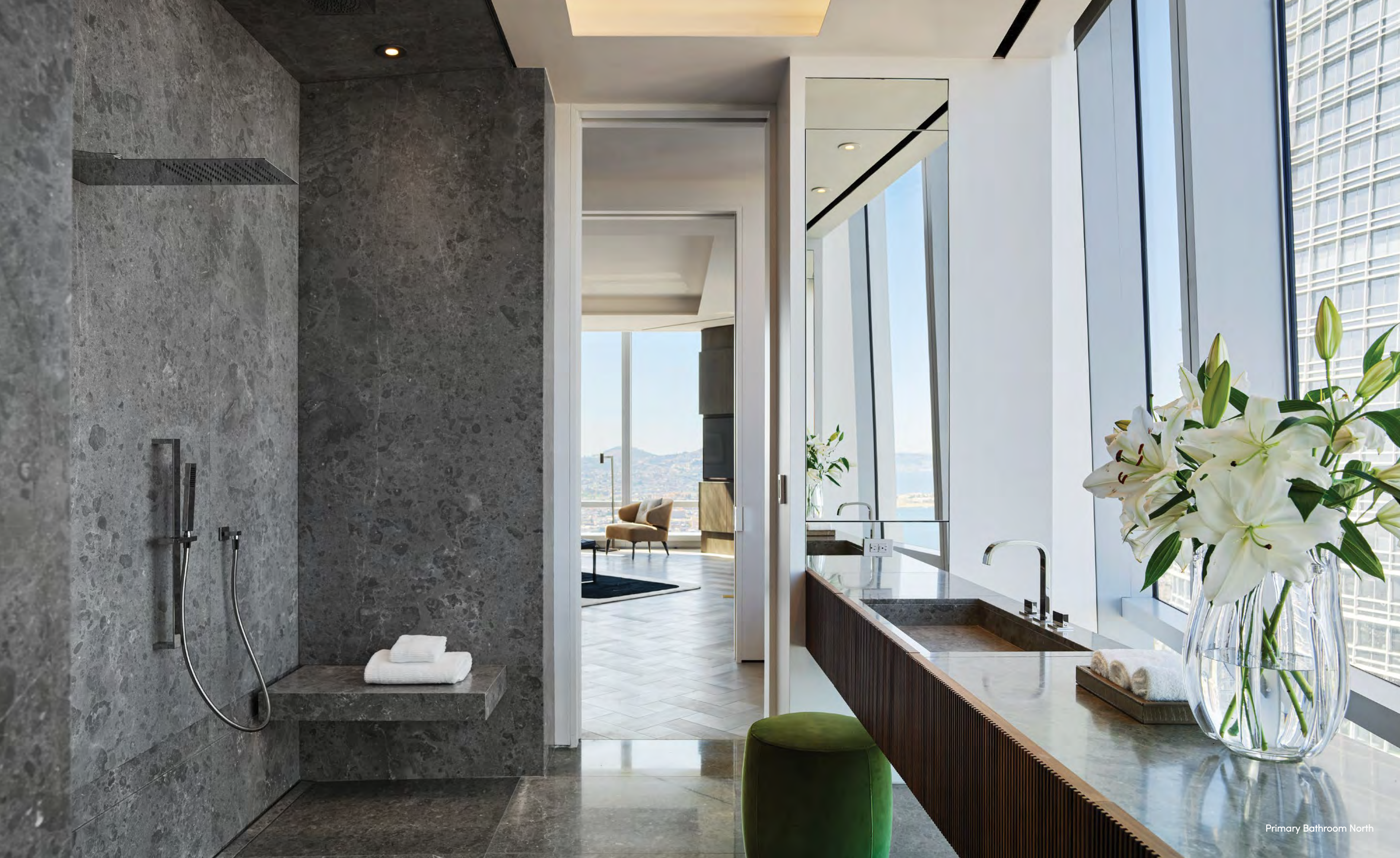
Primary Bathroom North