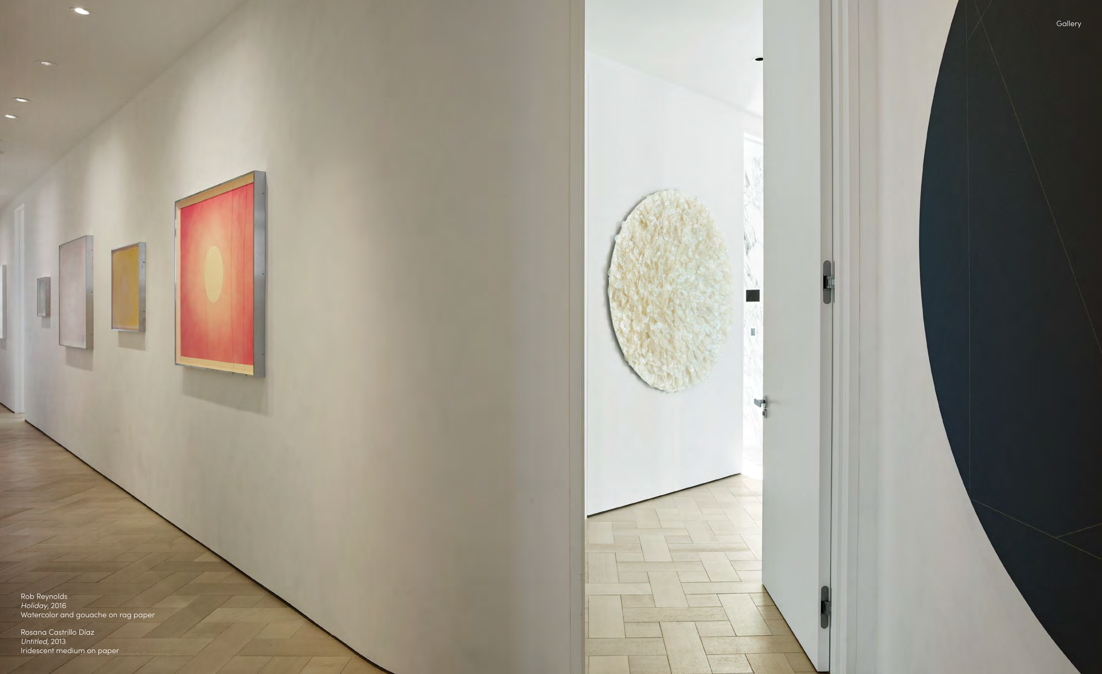
Rob Reynolds Holiday , 2016 Watercolor and gouache on rag paper