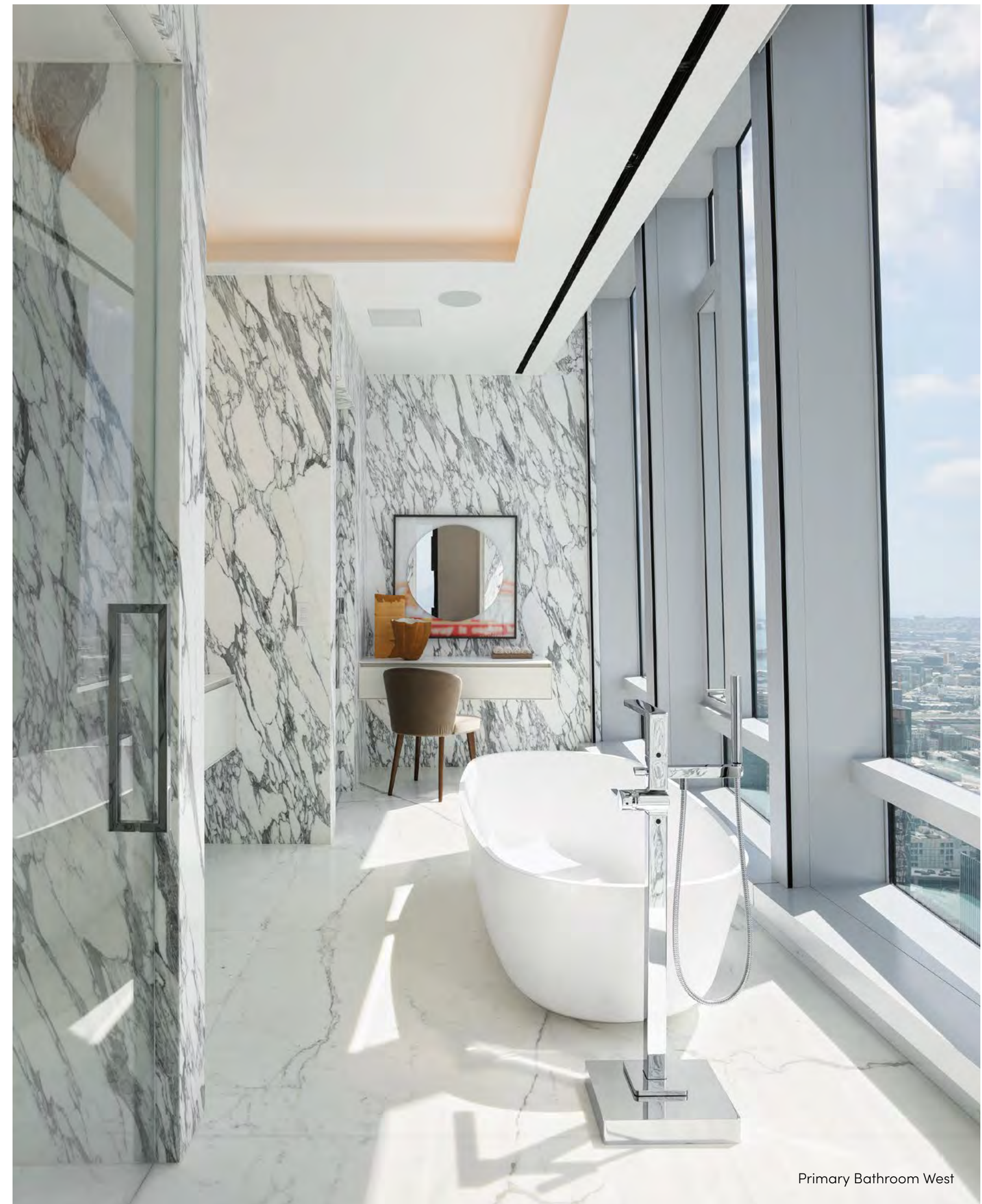
Primary Bathroom West

The north side of The Grand Penthouse features a second primary bedroom of resplendent Salvatori Gris du Marais marble, custom floating vanity with marble sink, concealed medicine cabinets, and private water closet. Adding to the spa-like experience is an oversized, marble steam shower with bench and Gessi Rettangolo plumbing fixtures. Primary bath north grants views of Transamerica Pyramid Center, Alcatraz, and the Bay.